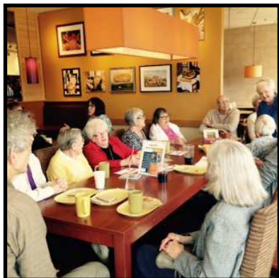
SAIL Birthday Club gathers to celebrate with coffee and conversation!